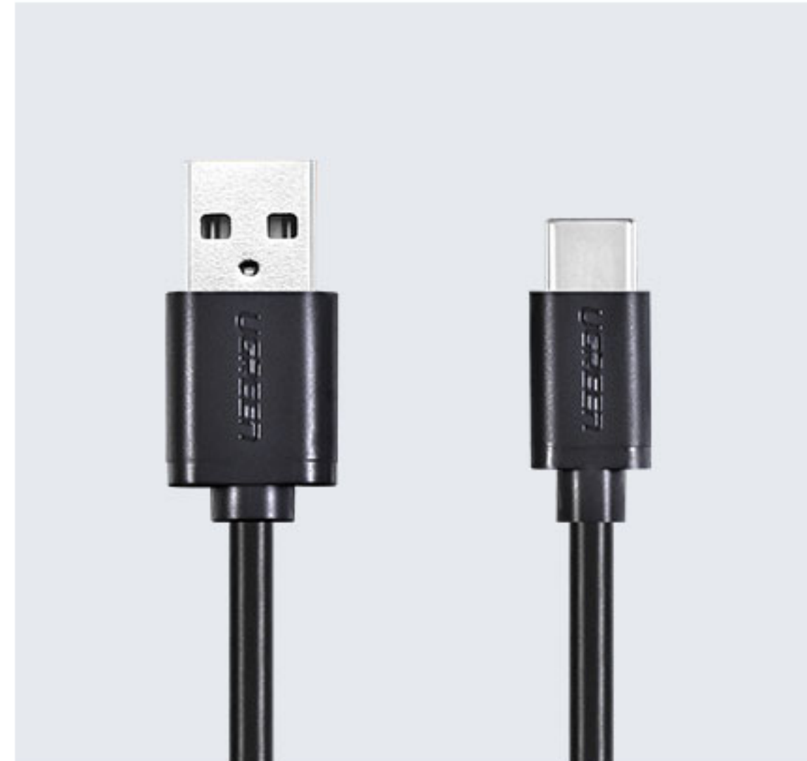
DC-BK-TypeC 1.0 meter Type-C cable