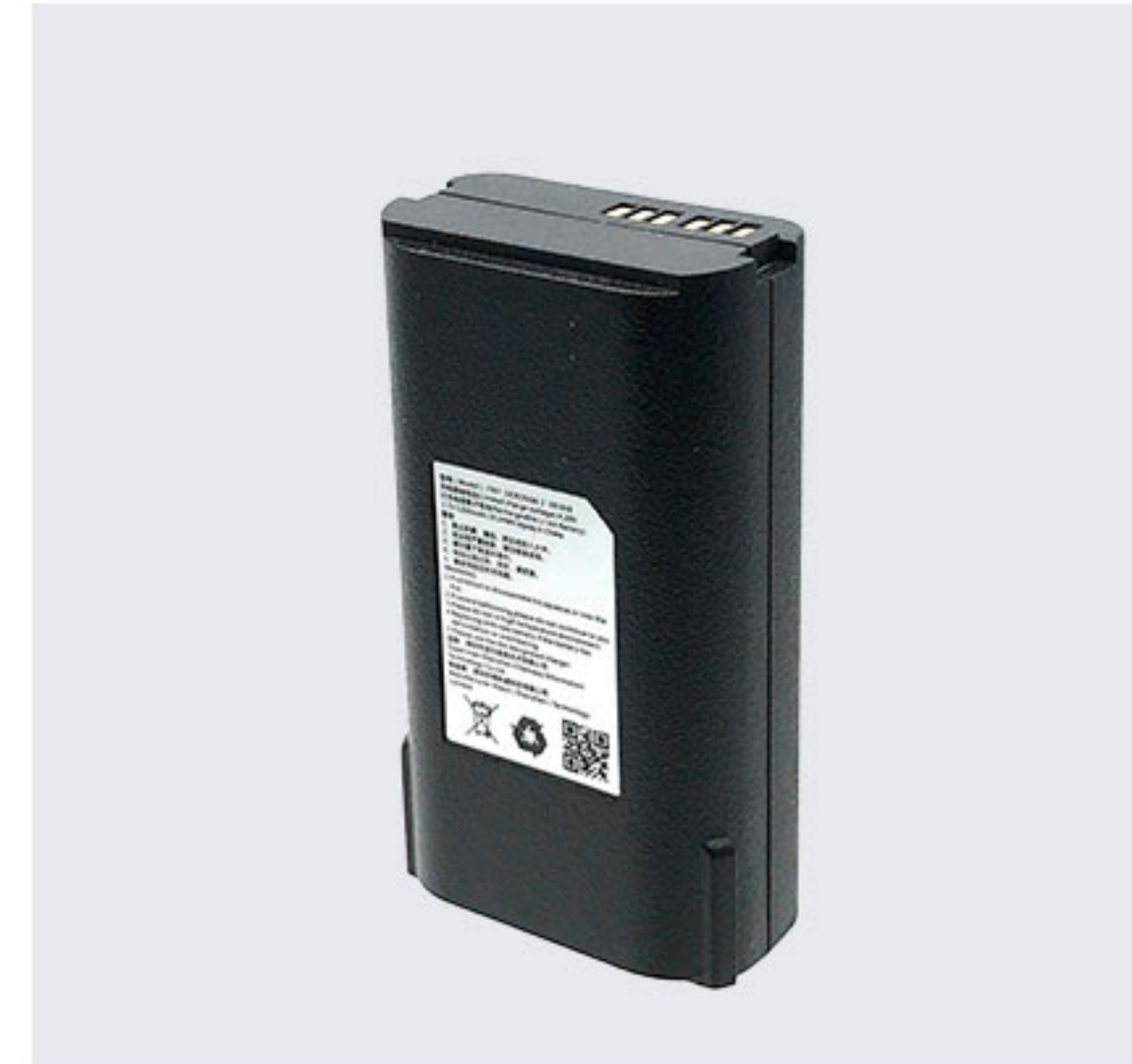
BTRY-C61-52MA 5200mAh Li-ion battery, 3.8V output